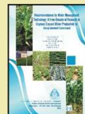
Technical Bulletin on Water Management (21 March, 2025)